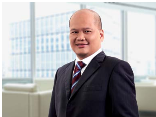
DATUK SHAHRIL RIDZA BIN RIDZUAN (DSIS),(PJN)