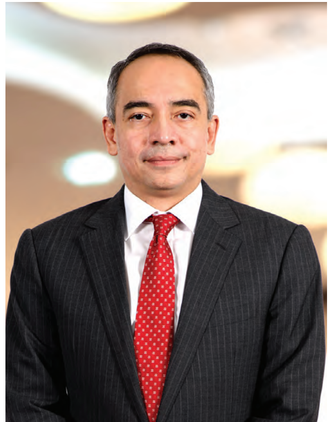
DATO' SRI MOHAMED NAZIR BIN ABDUL RAZAK Pengarah Urusan Kumpulan/Ketua Pegawai Eksekutif, CIMB Group Holdings Berhad (CIMB Group) (Wakil Profesional) / Group Managing Director/Chief Executive Officer, CIMB Group Holdings Berhad (CIMB Group) (Professional Representative) SIMP, DSAP, SSAP (NAZIR-RAZAK@epf.gov.my)

He graduated from University of Bristol with a Bachelor of Science (Hons) degree and later obtained a Master of Philosophy from University of Cambridge.