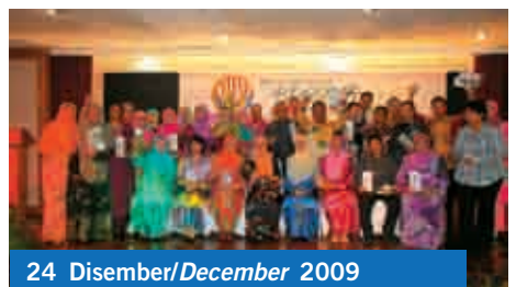
24 Disember/December 2009