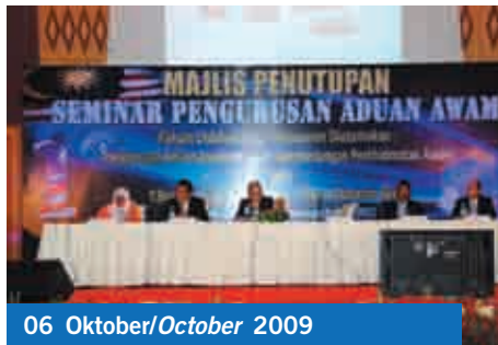
06 Oktober/October 2009