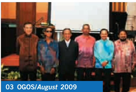
03 OGOS/August 2009