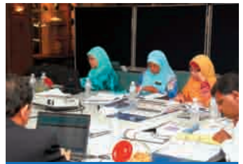
25 Mei/May - 01 Jun/June 2009