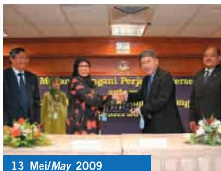
13 Mei/May 2009