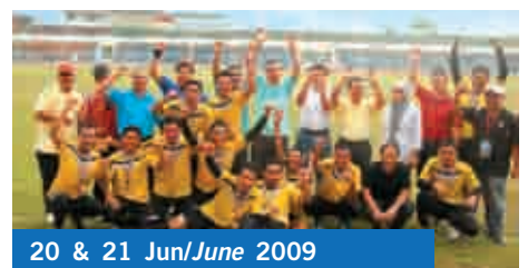
20 & 21 Jun/June 2009