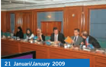
21 Januari/January 2009