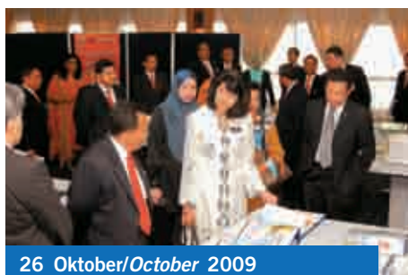
26 Oktober/October 2009