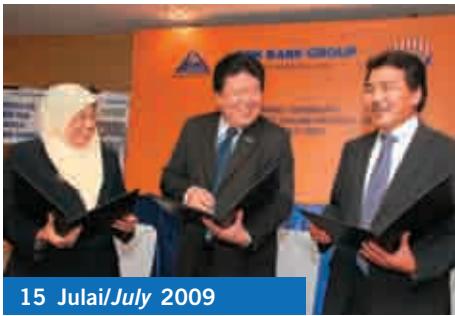
15 Julai/July 2009