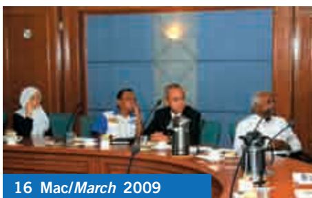
16 Mac/March 2009