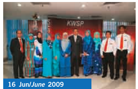
16 Jun/June 2009