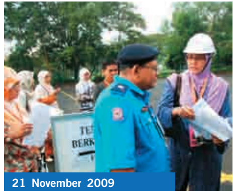
21 November 2009