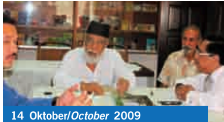
14 Oktober/October 2009