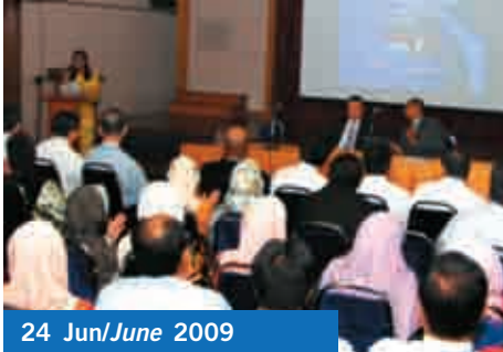
24 Jun/June 2009