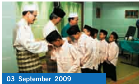
03 September 2009