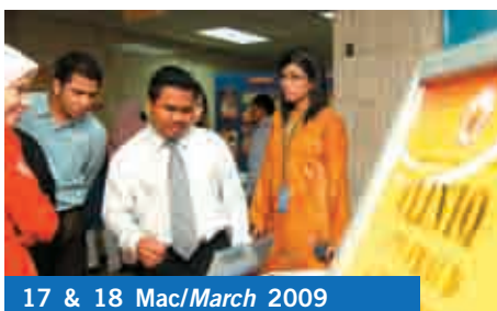
17 & 18 Mac/March 2009