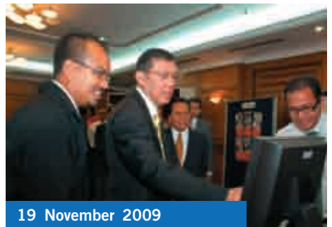
19 November 2009