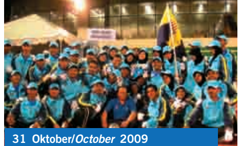
31 Oktober/October 2009