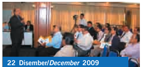
22 Disember/December 2009