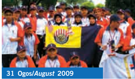
31 Ogos/August 2009