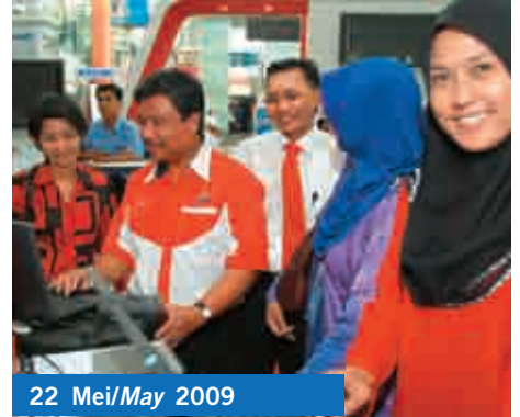
22 Mei/May 2009