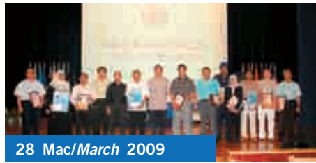
28 Mac/March 2009