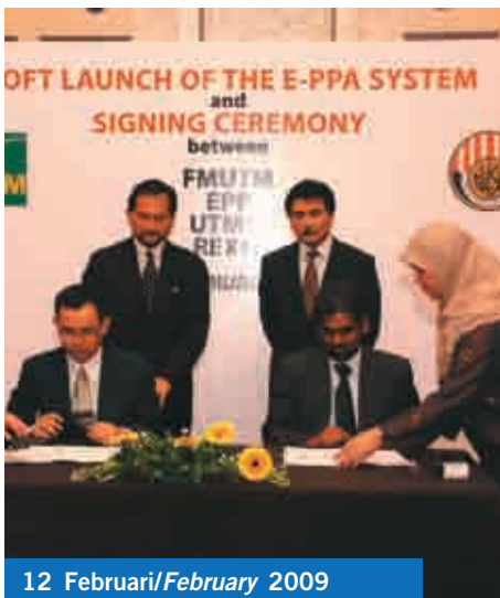
12 Februari/February 2009