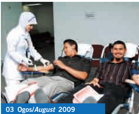
03 Ogos/August 2009