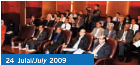
24 Julai/July 2009