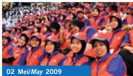
02 Mei/May 2009