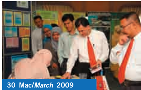
30 Mac/March 2009