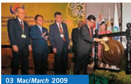
03 Mac/March 2009