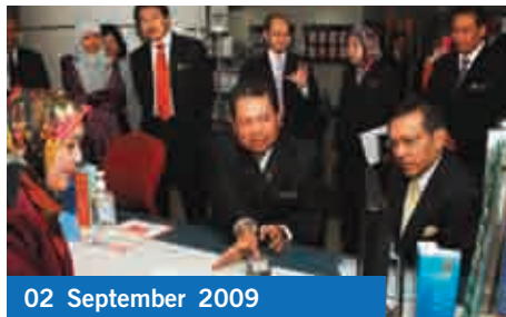
02 September 2009