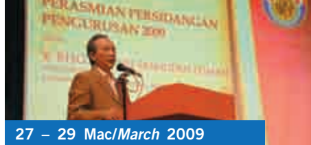
27 - 29 Mac/March 2009