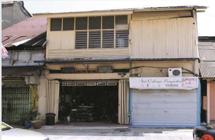
Old Shop in Kuala Terengganu (1979)