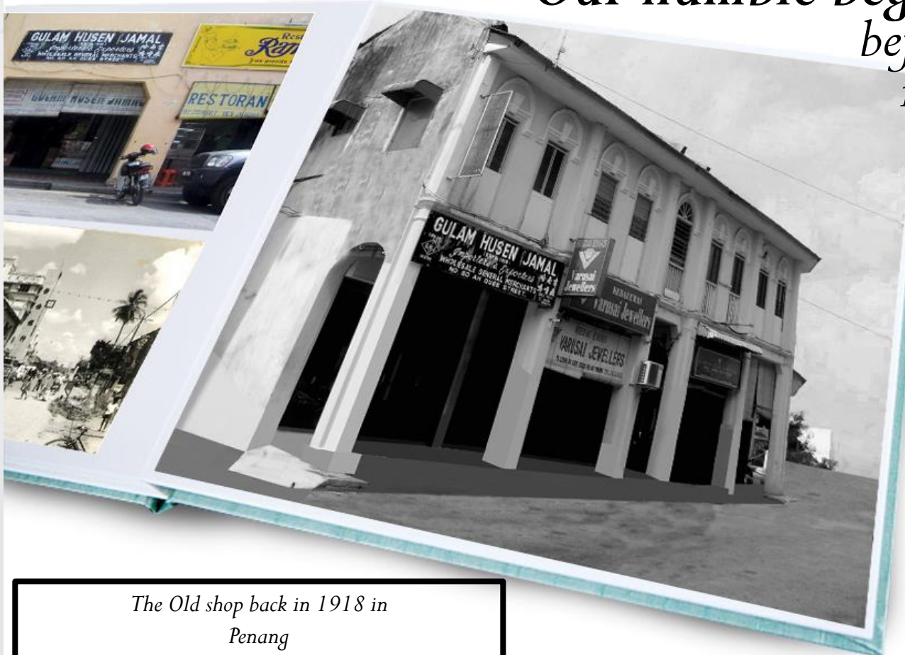
The Old shop back in 1918 in Penang