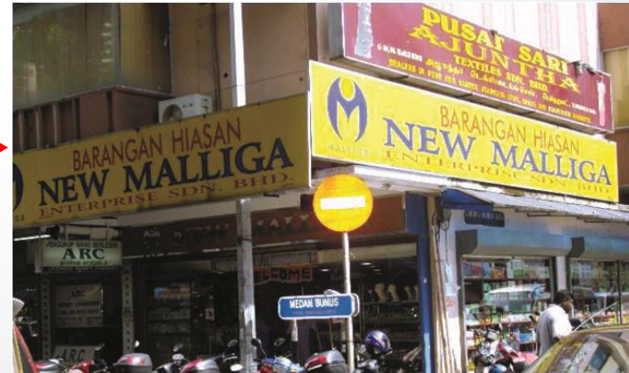
1 st shop in Jalan Masjid India, Kuala Lumpur (1987). Now occupied by New Malliga Enterprise Sdn. Bhd.